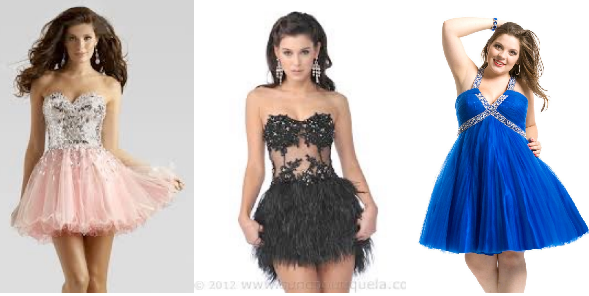
Too Short, Cleavage